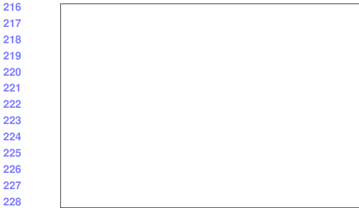
Figure 1. Example of caption. It is set in Roman so that mathematics (always set in Roman: B \sin A = A \sin B ) may be included without an ugly clash.

would have to be sure that no other authors could have been contracted to solve problem B.